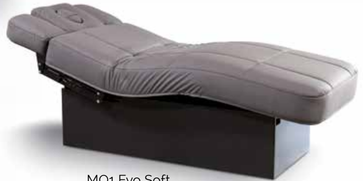
MO1 Evo Soft