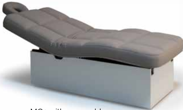
MO1 with removable face cradle and without armrests