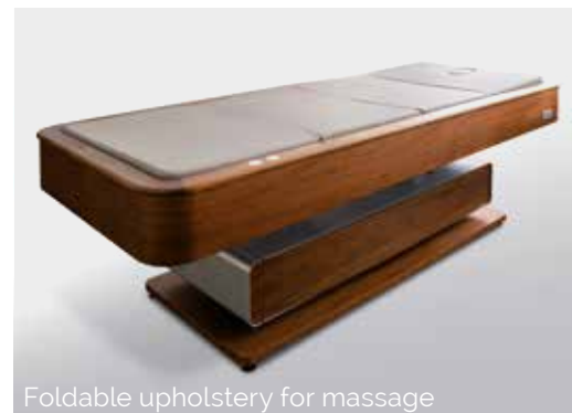
Foldable upholstery for massage