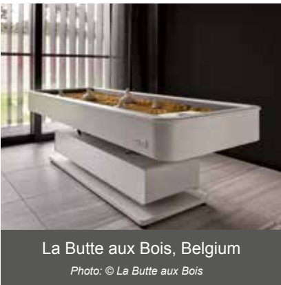
La Butte aux Bois, Belgium