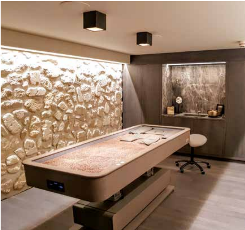
The Lamp Hotel, Sweden