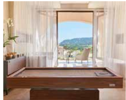
Park Hyatt Mallorca, Spain