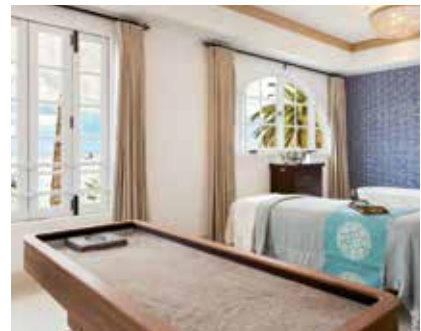
Island Spa Catalina, USA