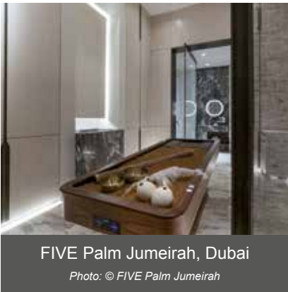
FIVE Palm Jumeirah, Dubai